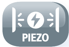
Fast piezoelectric ignitor